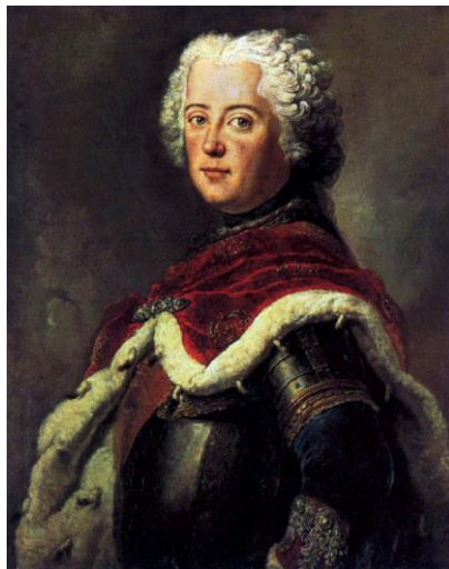
Frederick II ('the Great') (1712 - 1786)

FOLLIA is a baroque ensemble with a flexible combination of instrumental and/or vocal musicians as appropriate to the repertoire being performed.