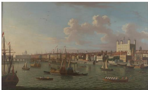
North Bank of the Thames (anon late 18 th century)