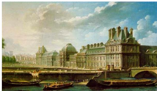
The Tuileries Palace (Nicholas Raguenet 1757)