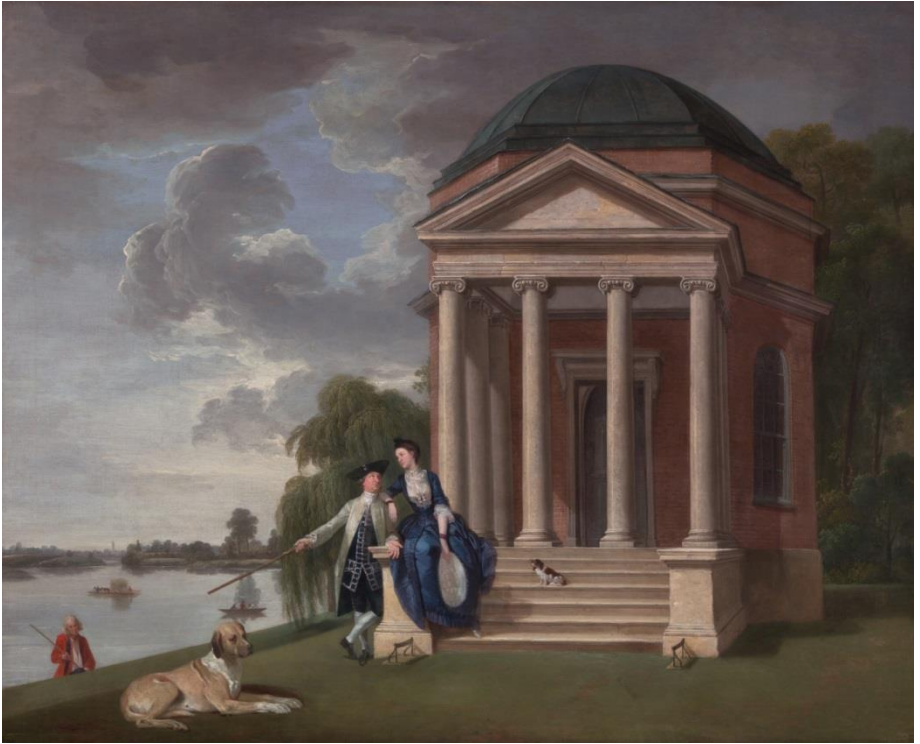
(David Garrick and his wife by his Temple to Shakespeare, Hampton, by Johan Zoffany c.1762)