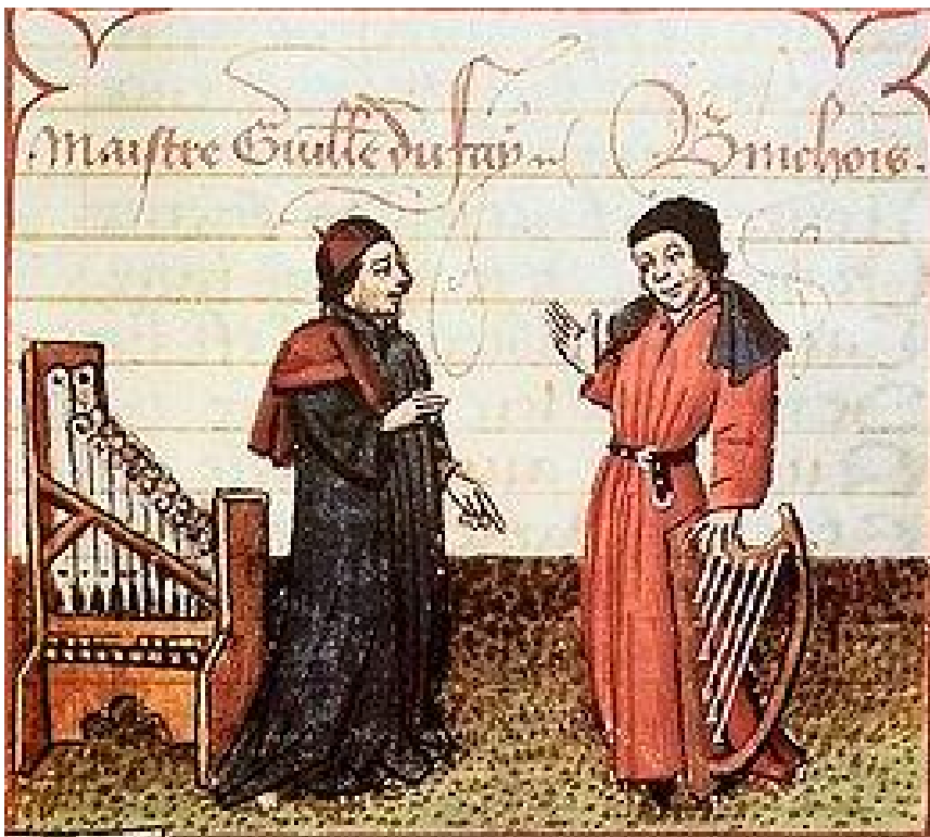
Above: Martin le Franc (1410 - 61), Guillaume Du Fay and Gilles Binchois, from Le Champion de Dames , c.1440