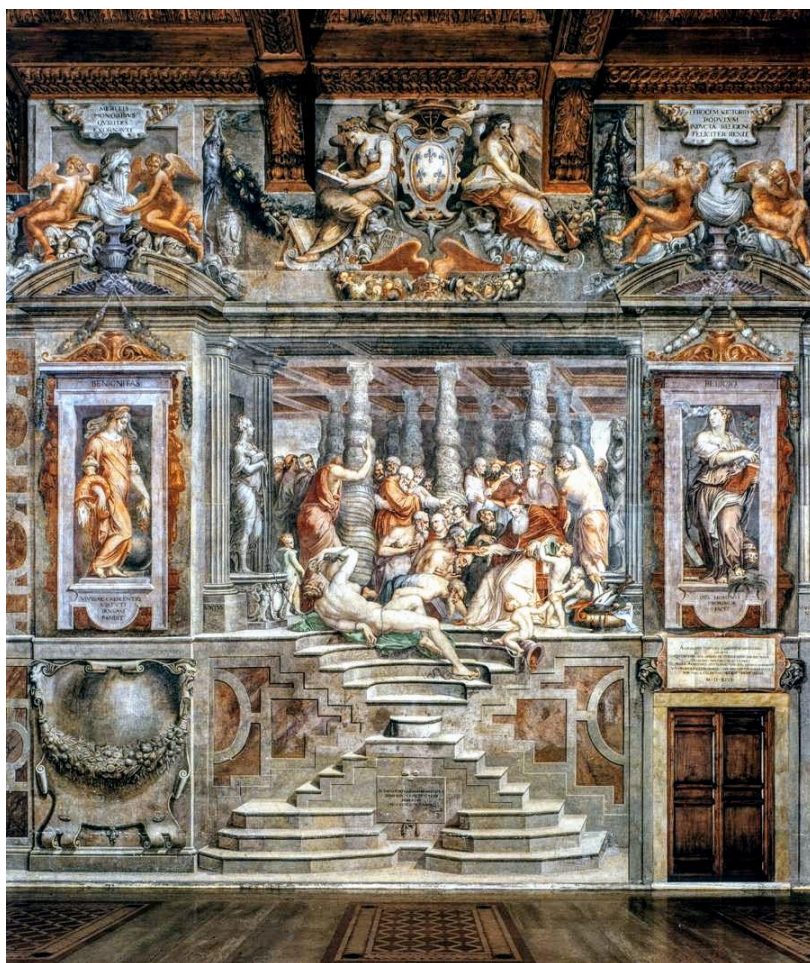
Above: Giorgio Vasari (1511 - 1574), Fresco, Sala dei Cento Giorni, Palazzo della Cancelleria, Rome, 1647