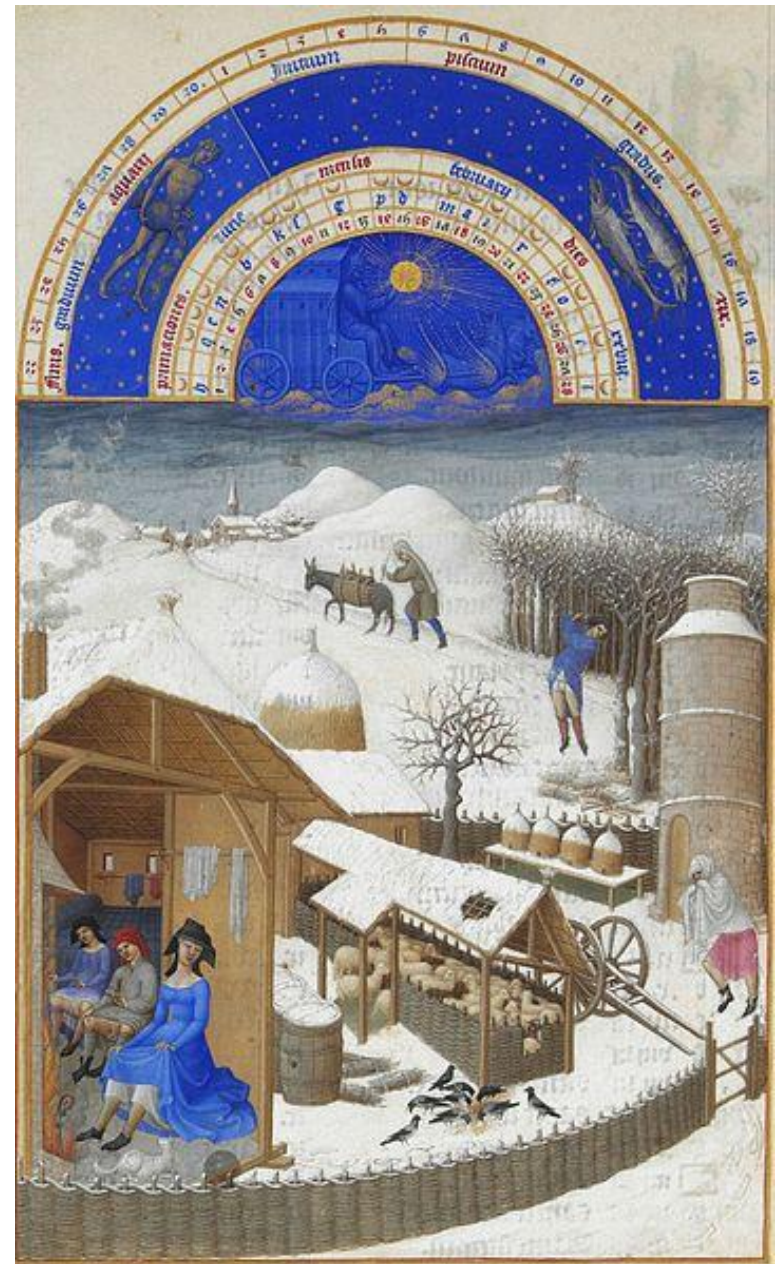
Above: Limbourg Brothers (fl. c.1380 - c. 1416), 'February' from Très Riches Heures du Duc de Berry , 1416 - 1416