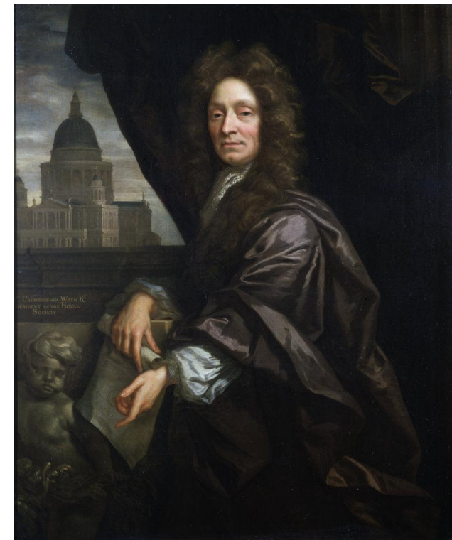
Right: John Closterman Portrait of Sir Christopher Wren (1632 - 1723), 1690