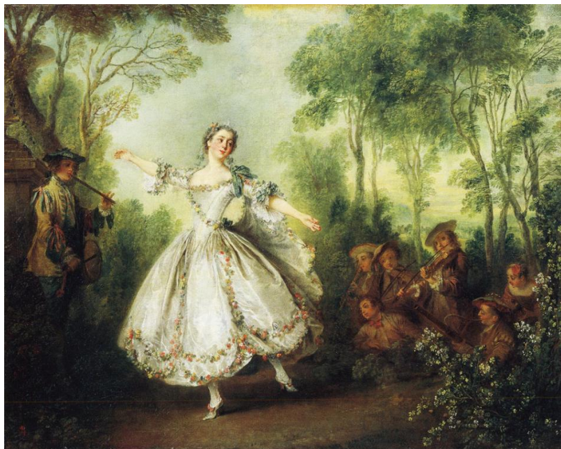
Above: Nicolas Lancret (1690 - 1743), Mademoiselle de Camargo Dancing , 1730 Marie-Anne de Cupis de Camargo (1710 - 1770)