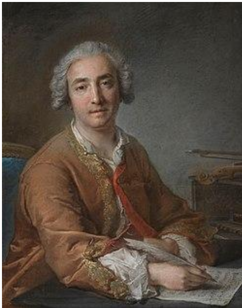
Left: Jean-Marc Nattier (1685 - 1766) Portrait of Pancrace Royer, 1750

Domenico Scarlatti (1685 - 1757) George Frideric Handel (1685 - 1759)