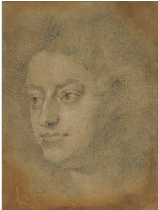
Left: John Closterman (1660 -1711) Chalk drawing of Henry Purcell, 1695