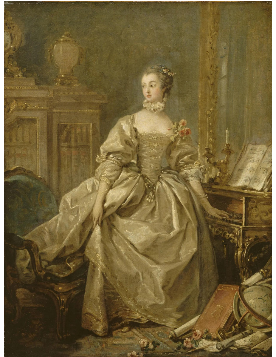
Above: François Boucher (1703 - 1770) Madame de Pompadour with her hand on a harpsichord , 1750