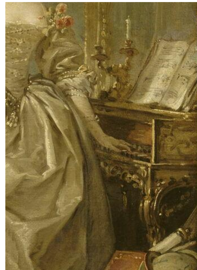
Above: François Boucher (1703 - 1770), detail from Madame de Pompadour with her hand on a harpsichord , 1750

Music from Renaissance, Baroque and Enlightenment Europe paired with works of art by Boucher, Lancet, Vasari, the Limbourg brothers and others