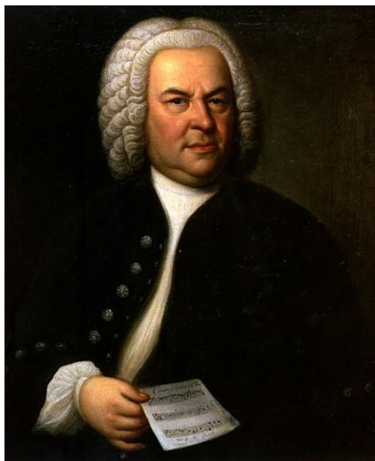
Johann Sebastian Bach (1685 - 1750)

In 1747 the aging Johann Sebastian Bach visited the cosmopolitan court of the young and highly musical King Frederick the Great of Prussia. This was the catalyst for the composition of his great late work Musical Offering dedicated to the king. This programme explores the contrasting styles of Frederick's court composers including Bach's son Carl Philipp Emmanuel and the king himself. It culminates with Bach's monumental Trio Sonata from Musical Offering . The magnificent eighteenth century Gothic interior of Strawberry Hill House (built around the same time) provides an atmospheric backdrop.