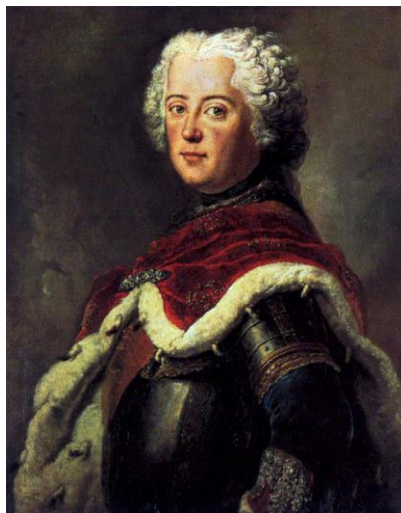
Frederick II ('the Great') (1712 - 1786)

FOLLIA is a baroque ensemble with a flexible combination of instrumental and/or vocal musicians as appropriate to the repertoire being performed.