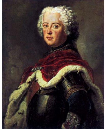
Frederick II ('the Great') (1697 - 1764)

FOLLIA is a baroque ensemble with a flexible combination of instrumental and/or vocal musicians as appropriate to the repertoire being performed.